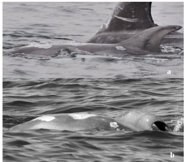
Figure 4. Medium to very large light gray cutaneous lesions in calf 492C in May (a) and November 2011 (b). During that six month period, skin lesions had developed on the dorsal fin that had completely bent.