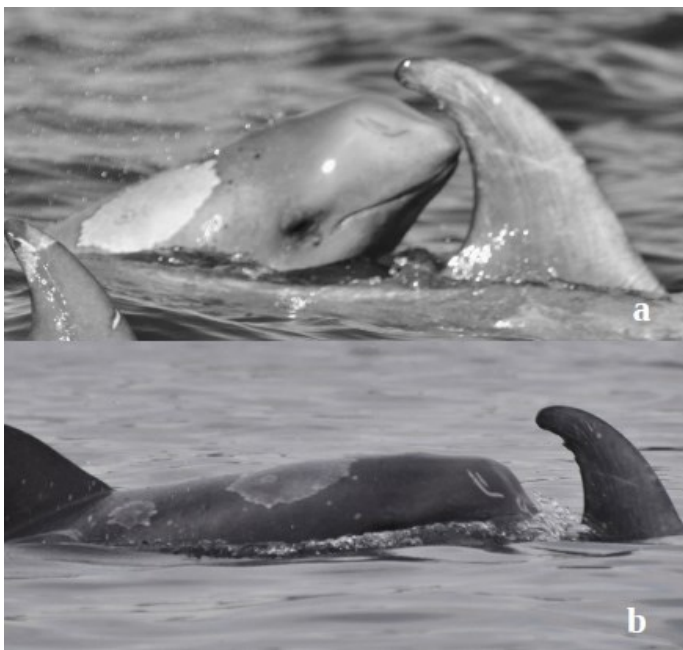
Figure 3. Large and very large light gray cutaneous lesions in calf 157C in May 2011 (a) and April 2012 (b). The lesions seem to be fading in 2012.