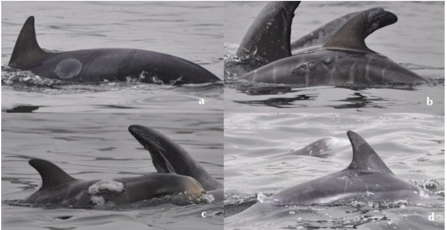
Figure 2. Grampus griseus . (a) A very large rounded, light gray lesion in neonate 422C on 23 April 2012; (b) Medium and large, ulcerated skin lesions in neonate 749C in May 2011; (c) Large and very large light gray skin lesions with a velvety appearance on the back and flank of neonate 498C in May 2011; (d) Large and very large cutaneous lesions resembling tattoo skin disease in calf 16C on 23 July 2011. Photographs reproduced with permission from authors.